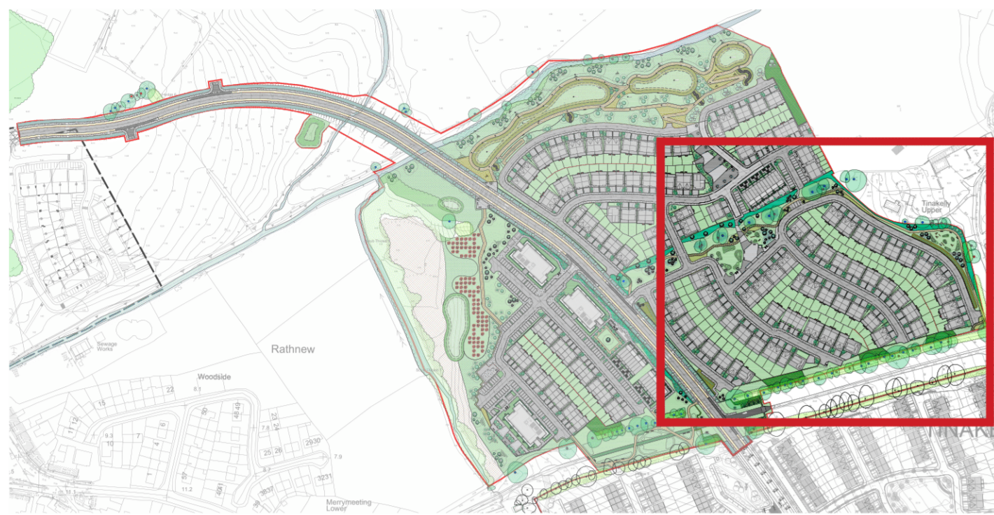
INDICATION PLAN SCALE: 1:5000A1